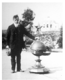
82. The Healing Temple or Ecclesia.