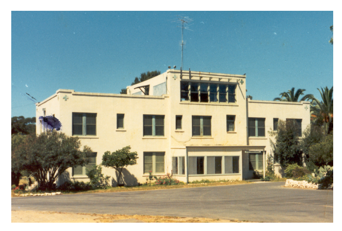
85. Rose Cross Lodge.

At about this time a number of improvements made life easier at Mount Ecclesia. The highway that passed the grounds was paved. The San Diego Gas & Electric Company began to supply Mount Ecclesia with electricity and gas, so the water, gas and electric troubles belonged to the past. Even the ice company, the grocer and the baker offered delivery to Headquarters.