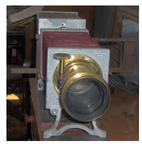
54. The stereopticon.

Armed with tacks, a hammer and a big armful of 8-inch by 10-inch advertising cards, he walked miles each day to tack up the cards where they would catch the eye of the public. He wrote his own newspaper reviews and took them to publishers, who were sometimes very prejudiced against the new Teachings, but his attractive personality often overcame their aversion and they would finally give him a whole page.