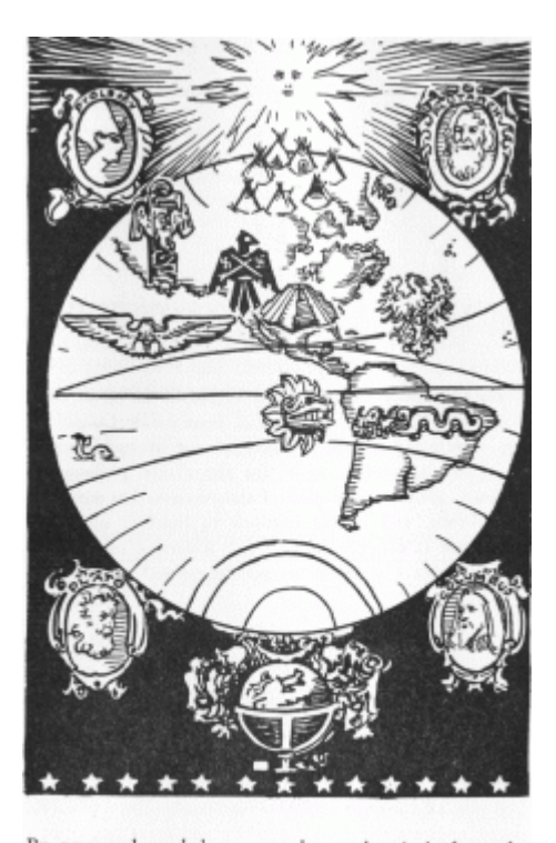
By preserved symbols we can know that it is from the remote past, from the deep shadows of the medieval world, as well as from the early struggles of more modern times, that the power of American democracy has come

The American nation desperately needs a vision of its own purpose.