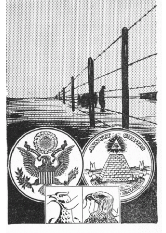
On the reverse of our nation's Great Seal is an unfinished pyramid to represent human society itself, imperfect and incomplete. Above floats the symbol of the esoteric orders, the radiant triangle with its all-seeing eye. Was it the society of the unknown philosophers who sealed the new nation with the ancient and eternal emblems?

emblem of the Great Architect of the Universe .... These three symbols in combination is more than chance or coincidence.