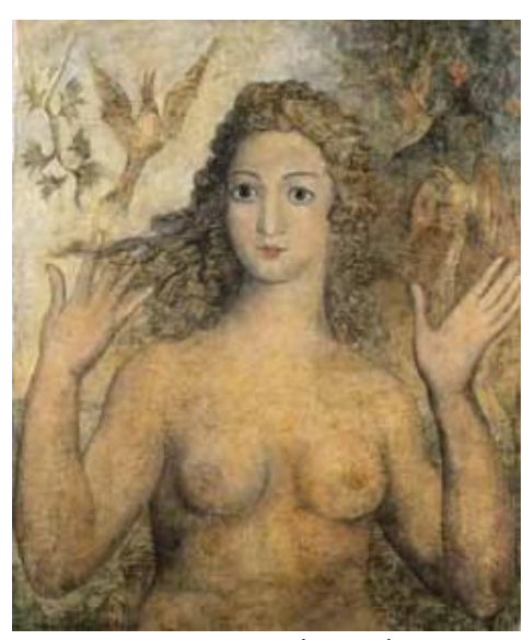
Eve Naming the Birds