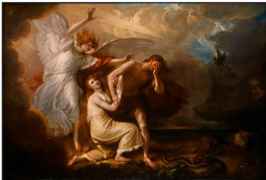
Expulsion of Adam and Eve from Paradise - West 1791

What we’re talking about in Scorpio is the motivation—all of the redemption or the regeneration through feeling; and through that feeling, wanting to reach for freedom and to do so through creation. This is the sign of creation and destruction; this is the sign of regeneration through creation. There is no one kind of human being. All of us are different with our idiosyncracies. There is the ideal and there is the broken standard that used to be for all human beings, but we are all in our own individual ways, even in our contrarian ways we are creatively regenerating.