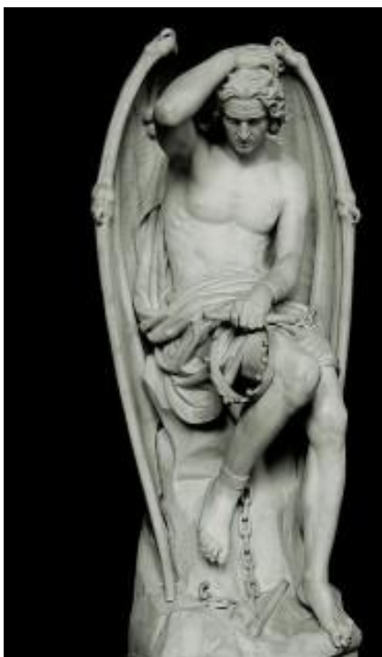
Lucifer - Guillaume Geefs - Belgium

as if serpents were coming up our spines. This is something we still see with waking consciousness now as we become clairvoyant, however it's not the Lucifers but it is the path of our own spinal energy from the sacrum to the genitals and up to the voice box and up into the cranium.