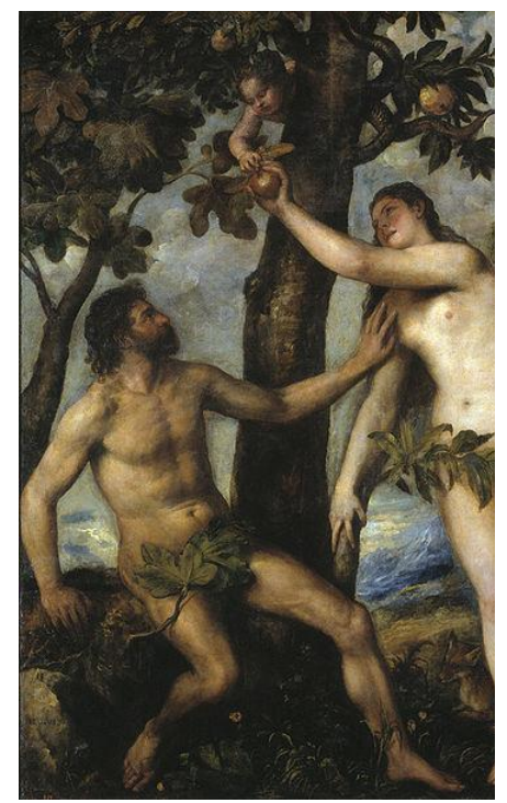
The Fall - Titian - 1570

hen we left off last time we spoke about regeneration and the Aquarian Age. We were relating Scorpio to Aquarius and we came into that subject which is The Fall of Humanity. Every time I come to that subject there are always a lot of problems. The purpose of the talk was to look at spiritual regeneration—spiritual regeneration from a place where we are way too absorbed with materialism.