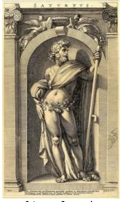
Saturnus - Caravaggi

Because the fundamental understandings have been skewed by the Satanic and Luciferic taint of commission and omission, there is a price to all of this. The material blindness is Satanic in nature. We think we can hide things, and the emergency with which we approach everything is Luciferic. The whole idea that we can just rush forward and dispose – the whole idea of disposability instead of looking at things as cycles or spiral cycles in an integrated whole is a Luciferic idea. I can just throw this beer can out the window; it doesn't make any difference. It's that kind of attitude because there is not the realization of connectivity of everything in truth, of everyone in spirit—in life spirit.