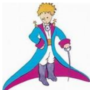
The Little Prince

Finally, one last little thought about altruism on the Aquarius/Leo pole, and that is, Leo rules the heart. Saint Exupery, in his beautiful little story, "The Little Prince" says "It is only with the heart that one can see true; what is essential is invisible to the eye."